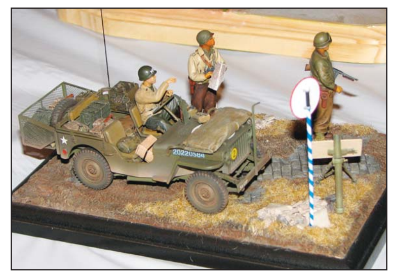
1:35th Tamiya Jeep w/Verlinden Figures - Art Miller