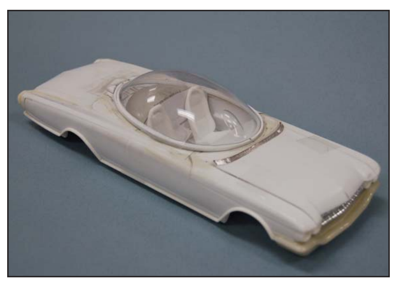
1:25th Revell 1959 model Cadillac Custom (under construction) - Ellis Kendrick