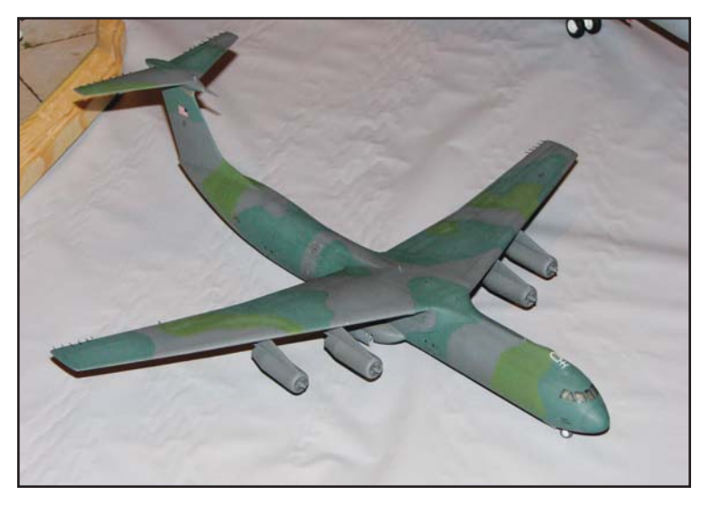
1:200th Testors C-141 - Brian Aldridge