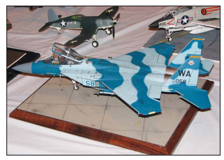
1:48th Revell F-15 Eagle - Terry Nichol