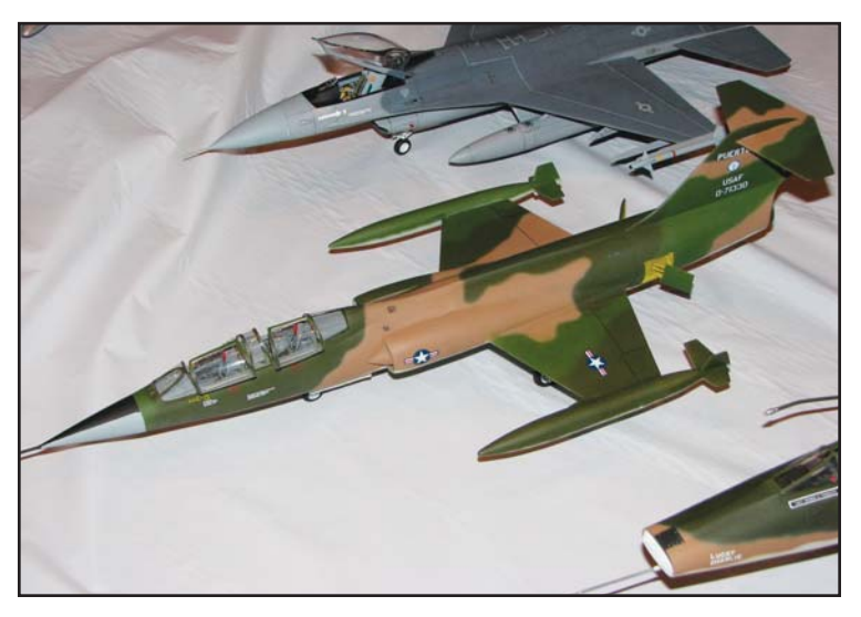
1:48th Monogram TF104-W - Frank Holsburg