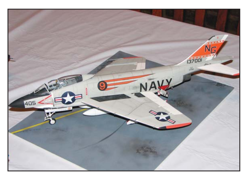
1:48th Grand Phoenix F3H Demon - Terry Nichol