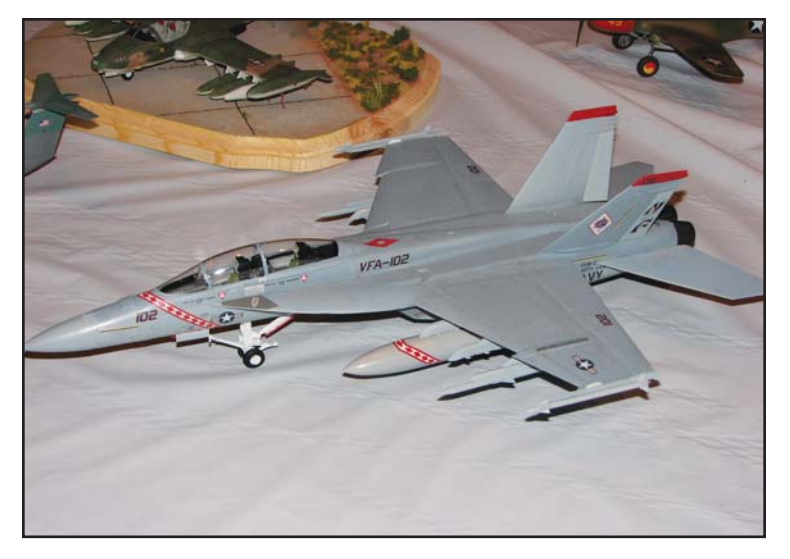
1:48th Hasegawa Hornet - Jami Aldridge