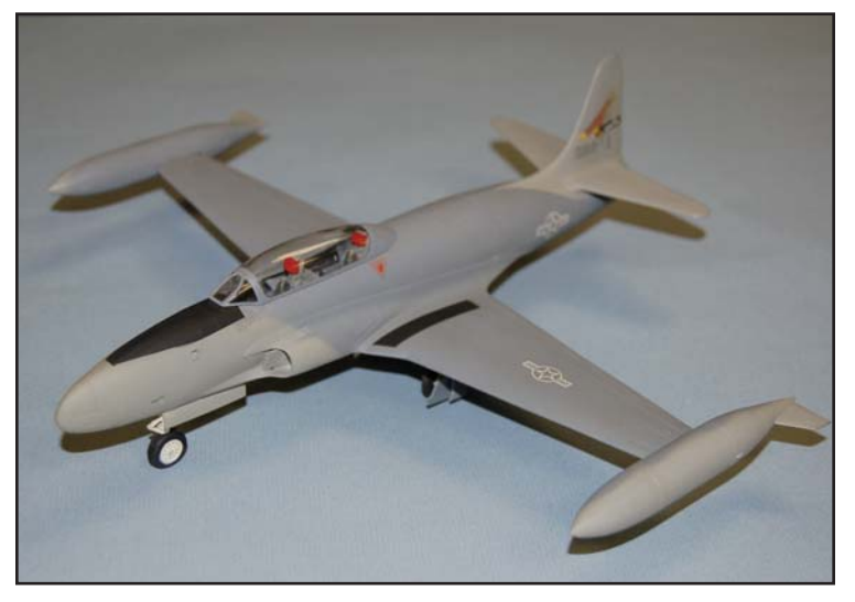
1:48th Hobby Craft T-33A out of box - Carlos Padilla