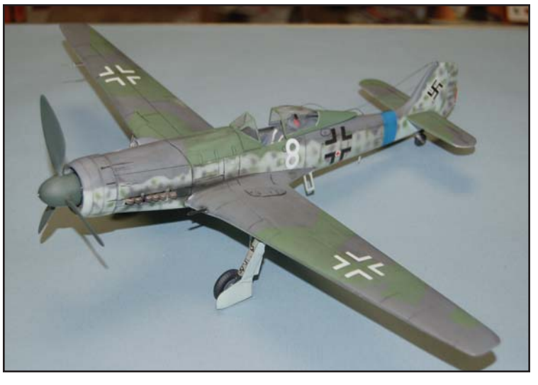
1:32nd Combat Vacuform kit, Ta-152 HO - Larry Hawkins