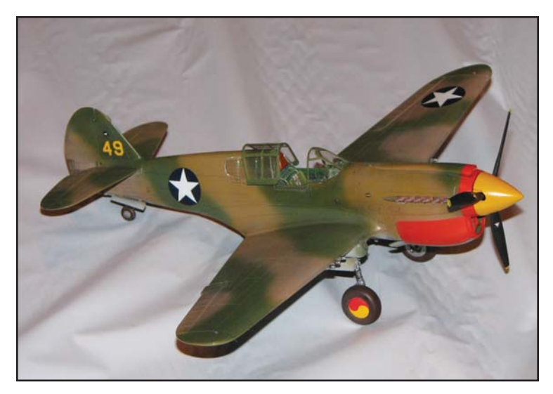
1:48th Hasegawa P-40E Tomahawk - Art Miller