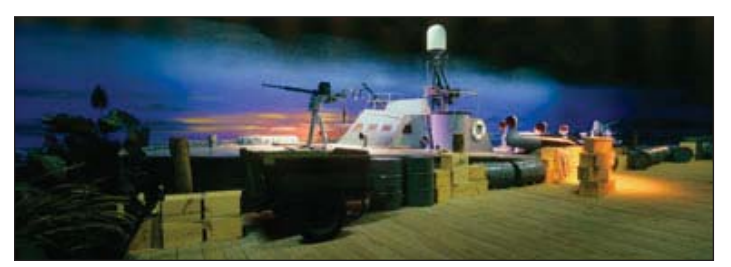
Restored PT 309