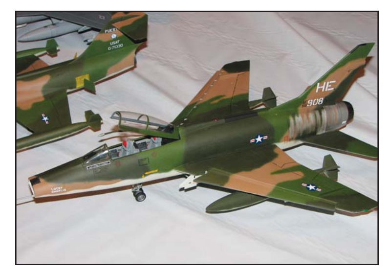
1:48th Monogram F100-F - Frank Holsburg