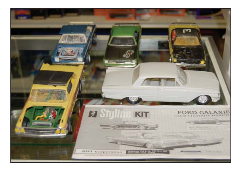
1:24th Five AMT car models, Two Fords, three Plymouth Dusters - Mike Williams