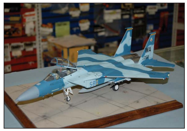
1:48th Revell F-15D - Terry Nichol