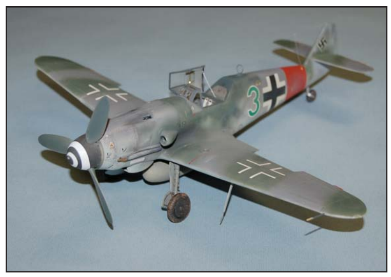
1:32nd Hasegawa Bf 109 G-10 - Greg Higginbotham