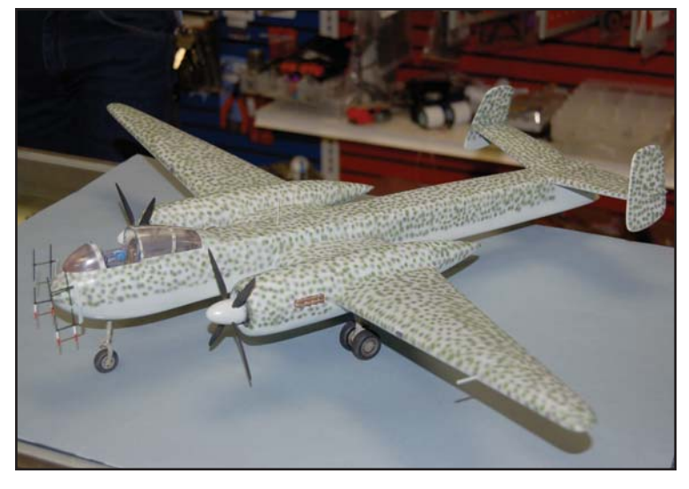
1:32nd HE-219 C-1 Completely scratchbuilt - Larry Hawkins