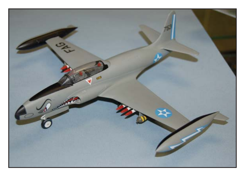
1:48th Hobby Craft T-33A out of box - Carlos Padilla