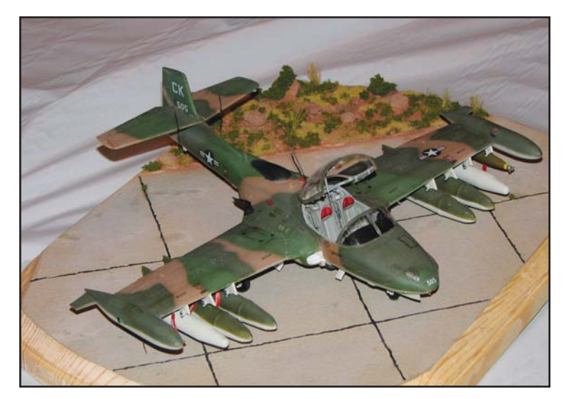
1:48th Revell A-37 - Brian Aldridge