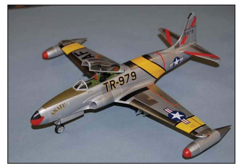
1:48th Hobby Craft T-33A - Frank Holsburg