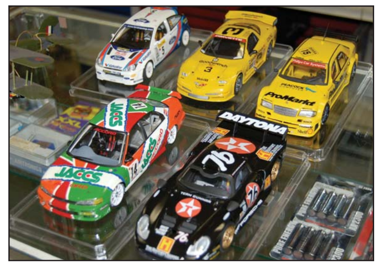
1:25th Five car models, One Revell and four Tamiya kits - Mike Harmon