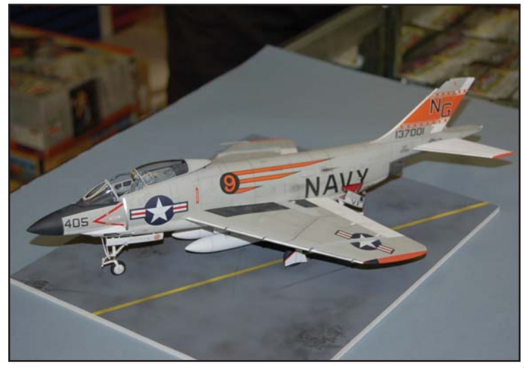
1:48th Grand Phoenix kit, FH3 Demon - Terry Nichol