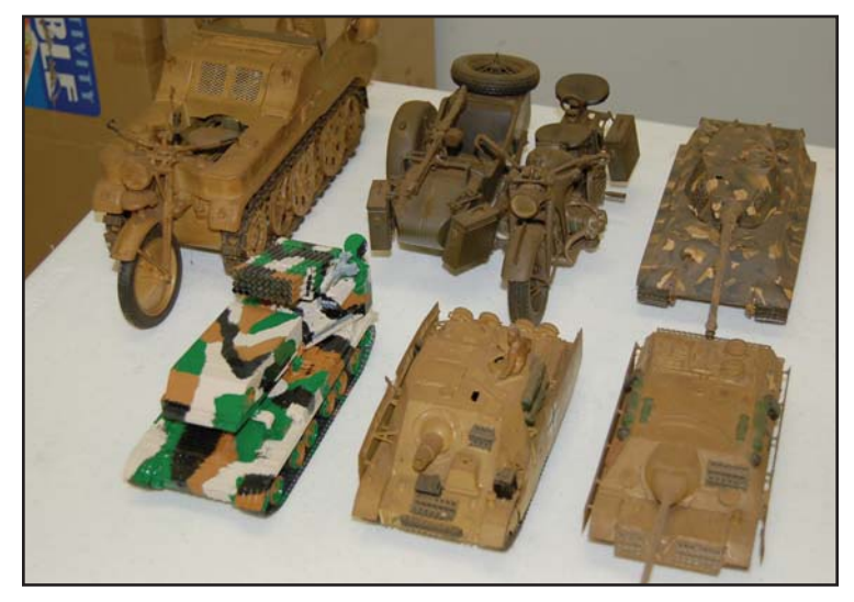
Collection of various scale, Military vehicles - Ernie Storm