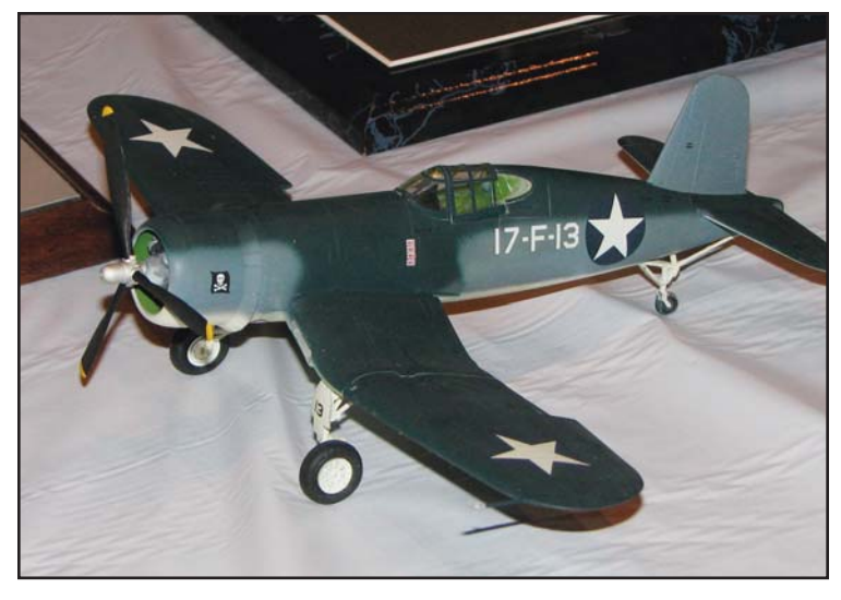
1:48th Tamiya F4U-1 - Carlos Padilla