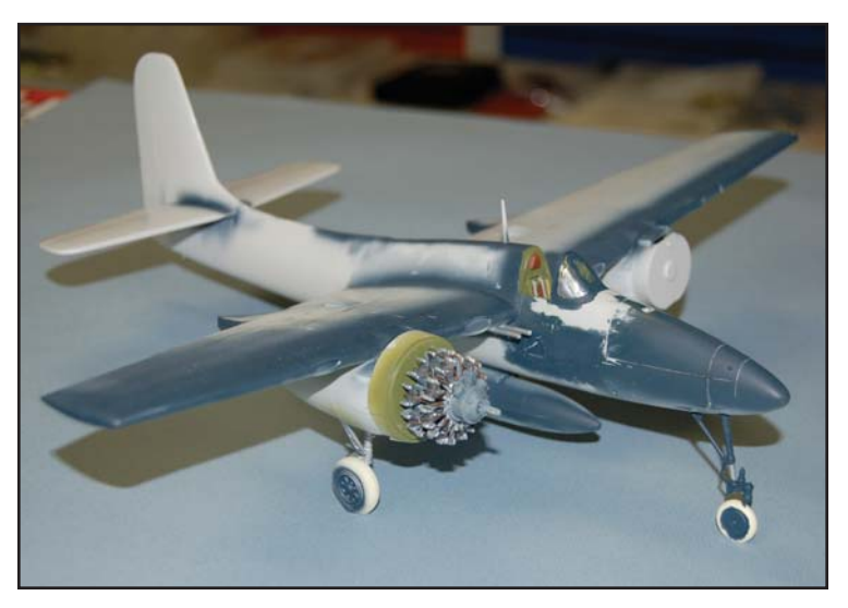
1:48th AMT F7F Tigercat (under construction) - Terry Barrow