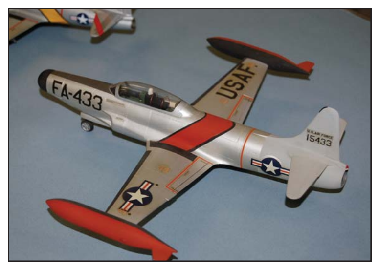
1:48th F-94B Scratchbuilt/kitbash; parts from four different kits needed to complete. - Frank Holsburg